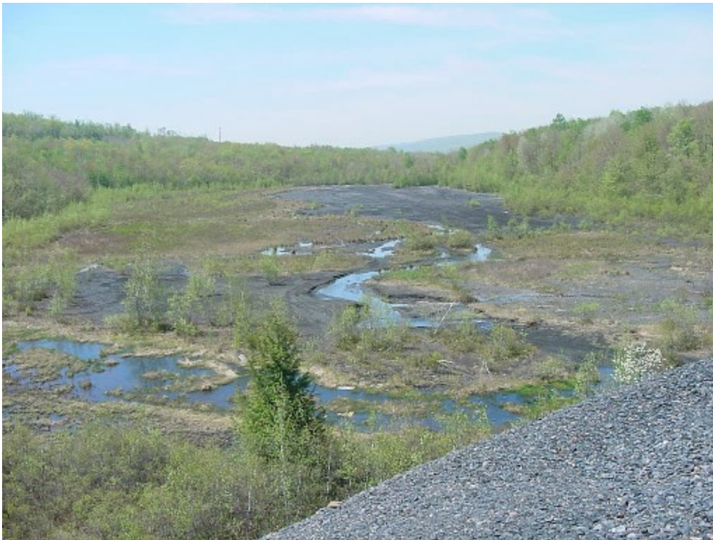
Upper Silt Basin on Powderly Creek in Carbondale Twp.