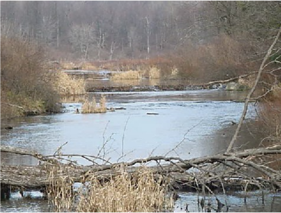
Mountain Mud Pond along the East Branch of the Lackawanna River