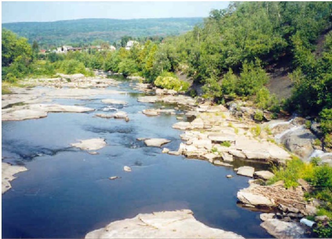
Lackawanna a River in Old Forge