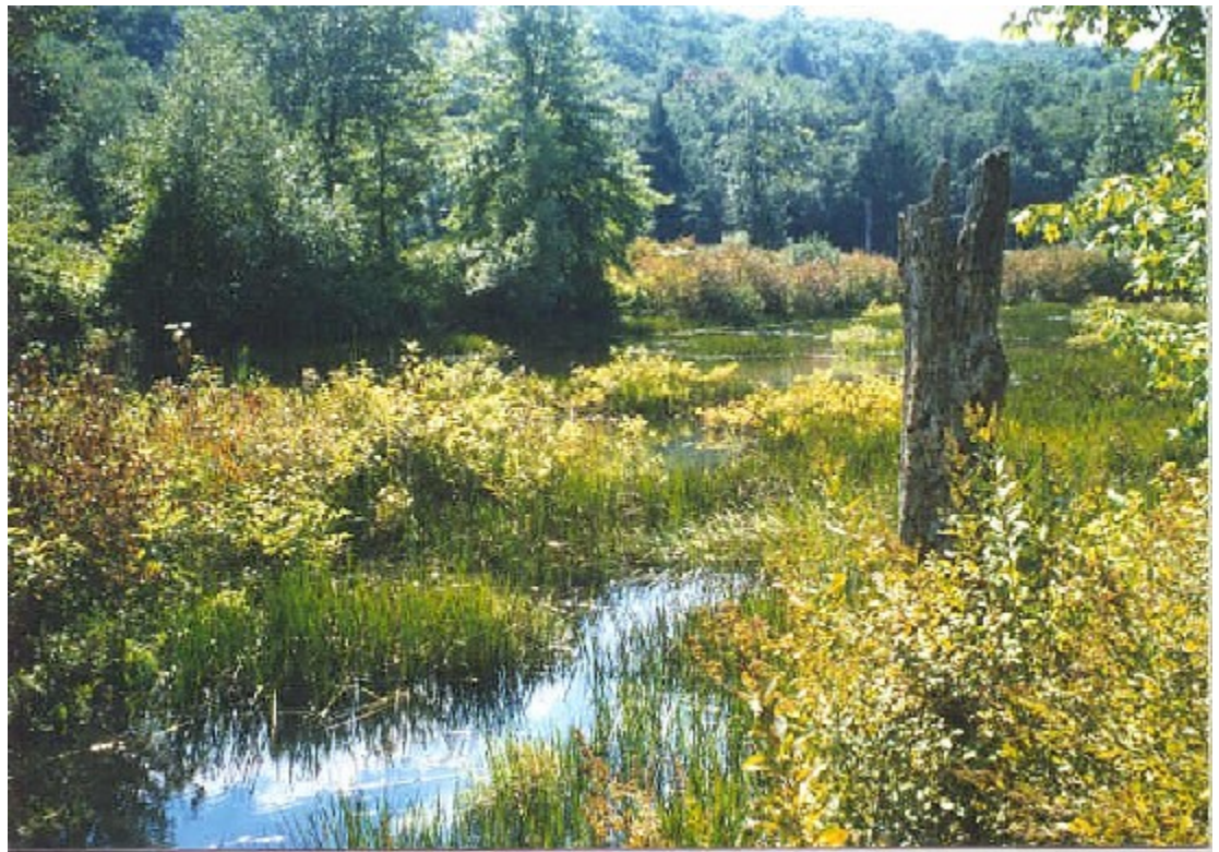
The “Little Virginia” wetlands along Stafford Meadow Brook