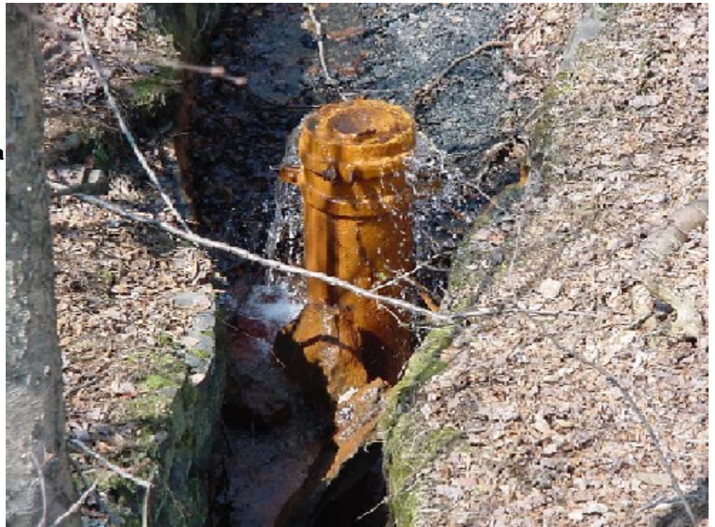
Standpipe discharge along the Lackawanna River near Vandling, PA. Its flow is less than 1 million gallons a day. This pipe was formerly a source of water for steam locomotives along the Delaware & Hudson Railroad.