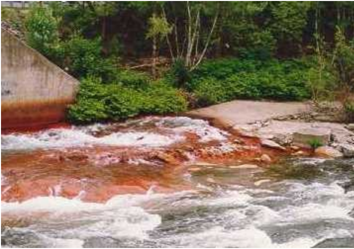
Outlet of the Old Forge Borehole adjacent to the Union St. Bridge, in Old Forge, PA. This borehole was constructed in 1962 by the Commonwealth of Pennsylvania. It discharges approximately 100 million gallons per day.