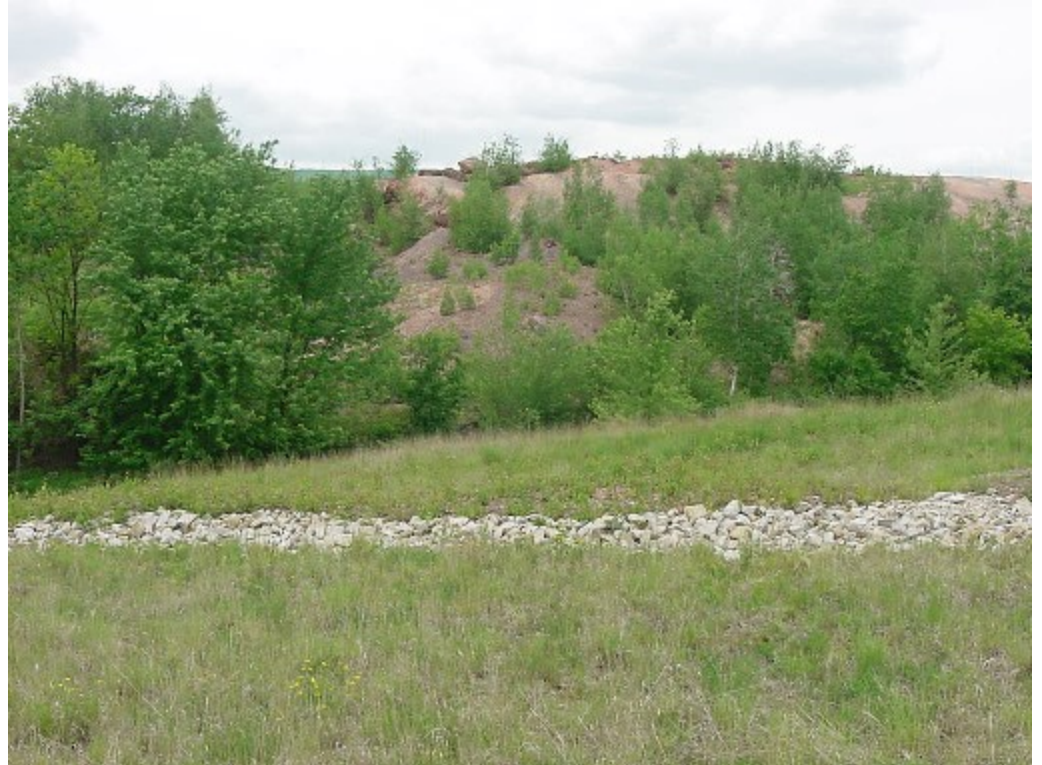
Mine reclamation completed by PA Bureau of Abandoned Mine Reclamation, on a bond forfeiture site in Taylor, PA