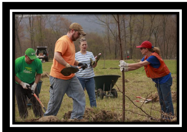
Tree Planting at the Hanover #9 AML Reclamation Site in Nanticoke, PA along Espy Run